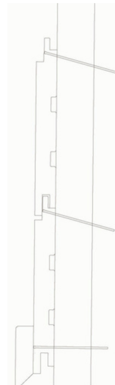
Example of concealed fixing